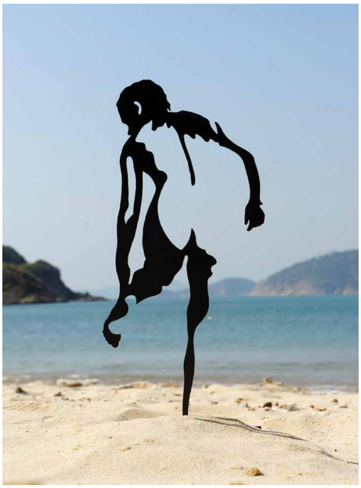
\textbf{Jonathan Thomson, Shadow Sculpture 11} \ (\text{maquette}), 2014, powdercoated aluminum, 38 x 17 x 0.2 cm.