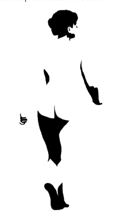
Jonathan Thomson, Nude Shadow 13 , 2014, stencil, 38 x 15 cm (Image).

they offered the subject an unusual view of themselves. Silhouette portraits were more highly regarded in the 18th century when they were used in the study of physiognomy—the belief that character can be read from the face—and in the 19th century when they were used in the pseudoscience of phrenology, which claimed to establish relationships between character and the prominences of the skull.