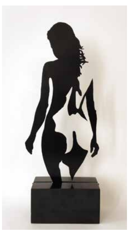
Jonathan Thomson, Shadow Sculpture 21 (maquette), 2014, powdercoated aluminum, 38 x 17 x 0.2 cm.

finished printed design makes the careful placement of each line a particularly terse discipline. The title of the series refers to the fact that they were all painted in a pure-white matt gesso and set against a thick impasto, glossy-white background.