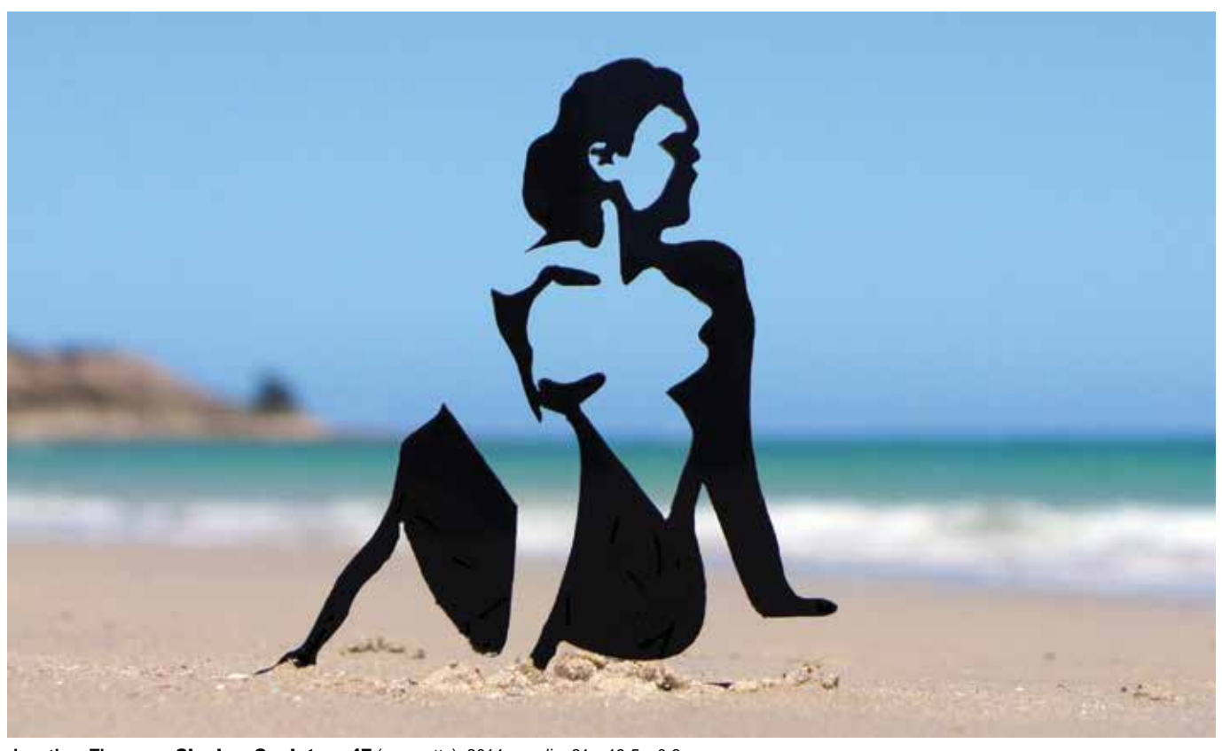
Jonathan Thomson, Shadow Sculpture 17 (maquette), 2014, acrylic, 21 x 19.5 x 0.3 cm.