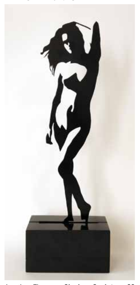
Jonathan Thomson, Shadow Sculpture 23 (maquette), 2014, powdercoated aluminum, 39.5 x 11.5 x 0.2 cm.

In the 20th century there was a paradigm shift away from the representation of light to the reality of light itself. Neon is an essentially 20th century substance. The simplicity and clarity of the medium, and that of the messages it conveys, links it chronologically and conceptually to Pop Art. But neon is a material that requires highly specialized technical