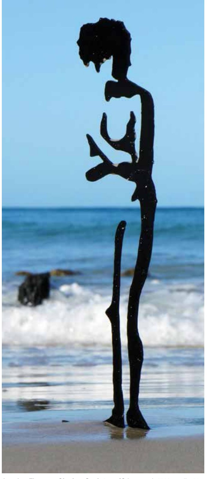
Jonathan Thomson, Shadow Sculpture 12 (maquette), 2014, acrylic, 39.5 x 12 x 0.3 cm.

figures to neoclassical depictions of civic virtues. These are some of the best-loved and most enduring images in the whole of human history. But these days we tend to shy away from presenting representations of people in public. We are quite happy to accept massive advertising hoardings with images of men and women in vari-