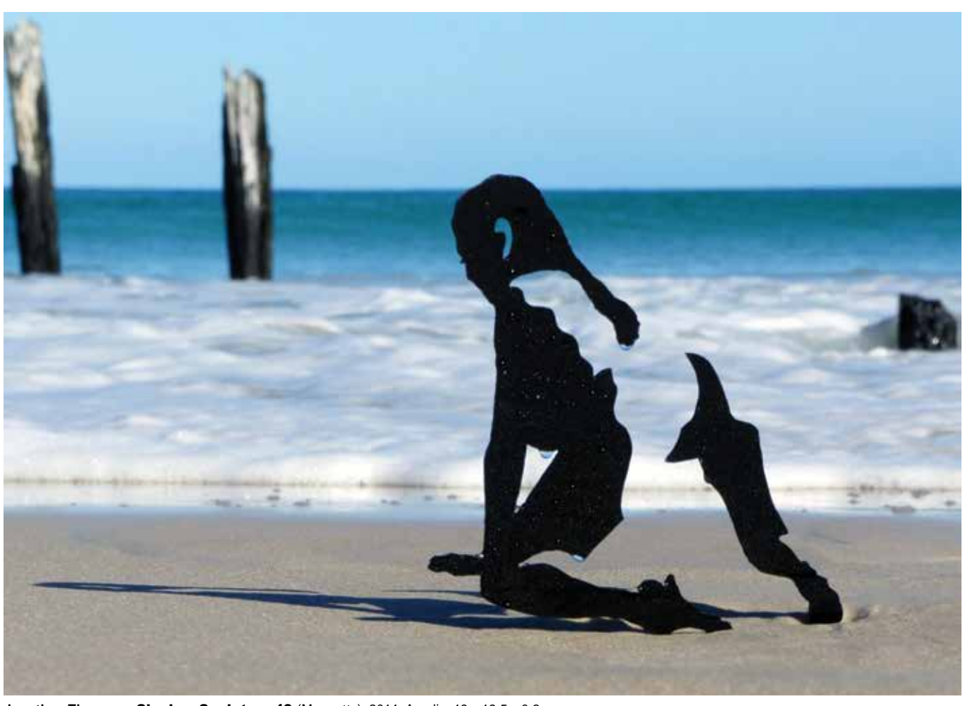
\textbf{Jonathan Thomson, Shadow Sculpture 19} \ (\text{Maquette}), 2014, \text{Acrylic}, 19 \ x \ 19.5 \ x \ 0.3 \ \text{cm}.