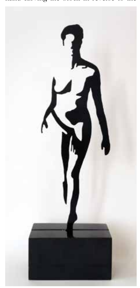
Jonathan Thomson, Shadow Sculpture 24 (maquette), 2014, powdercoated aluminum, 40 x 13.5 \times 0.2 cm.

y interest in shadows stems from light. In 2007 I made a series of paintings called White Girls that were conceived as an expression of the eternal feminine and were made by flattening the image and reducing it to a series of stylized lines without any tone or modeling. They were based on a reductive approach to line that stems from printmaking where the practice of hand-carving the block in reverse to the