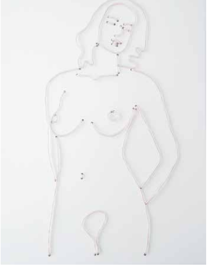
Jonathan Thomson, EL 8, 2011, electroluminescent wire on aluminum composite panel, 41 \times 31 \times 5 cm.