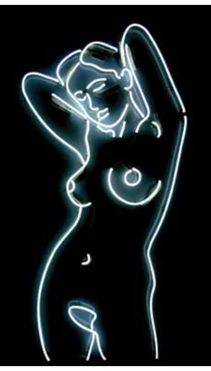
Jonathan Thomson, Neon Nude 1, 2010, 9mm white 4500° neon on acrylic in custom steel frame, 144 x 81 x 6 cm. Edition 3 + 1AP.

My Light Girls, Still Life, and Cloudscape series of works were all made by hand embroidering EL wire