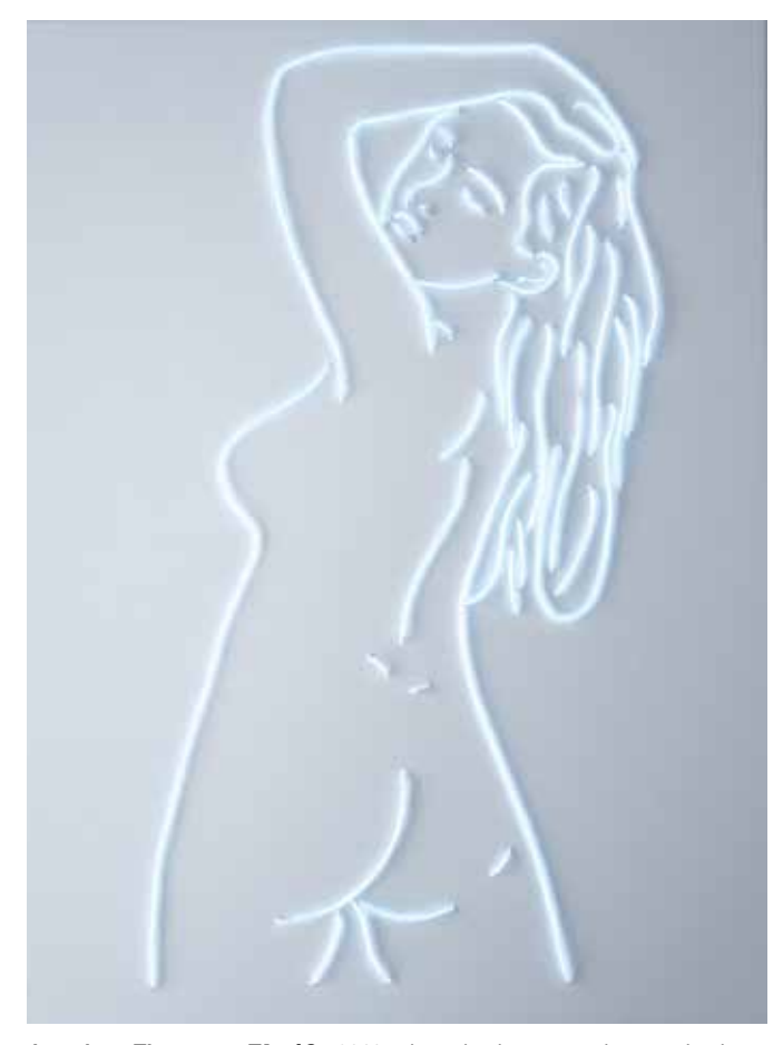
Jonathan Thomson, EL 10, 2011, electroluminescent wire on aluminum composite panel, 41 \times 31 \times 5 cm.

These images are pared down in the simplicity of their line and minimalist in their appearance. They strive to give form to the indeterminate, to render the invisible visible and to give the fleeting intangibility of time solid form. They engage with light as a form of energy and also with all of its metaphorical connotations. The use of physical light to make art conveys important messages about the nature of art and light and enlightenment. The luminous brightness and clear radiance of white light is a metaphor for revelation, illumination, awareness, wholeness, harmony, and grace. Light is an evocative symbol of life, salvation, knowledge, clarity, perfection, and enlightenment. My use of electroluminescent wire is an explicit reflection on the mechanisms of signification by presenting